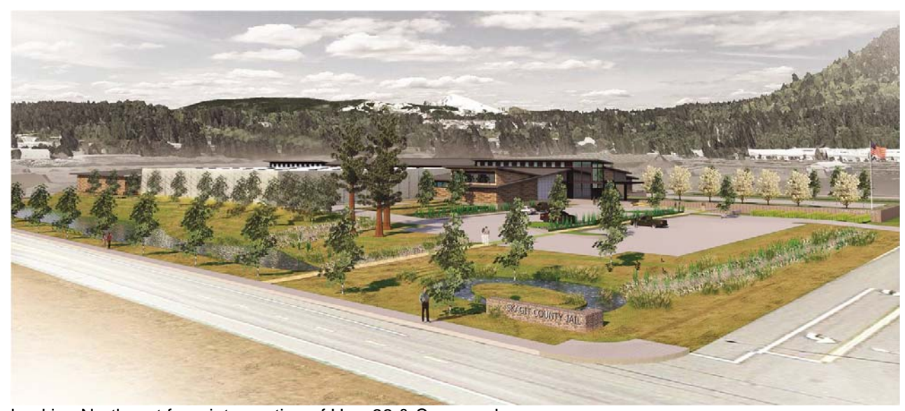
Looking Northeast from intersection of Hwy 99 & Suzanne Lane